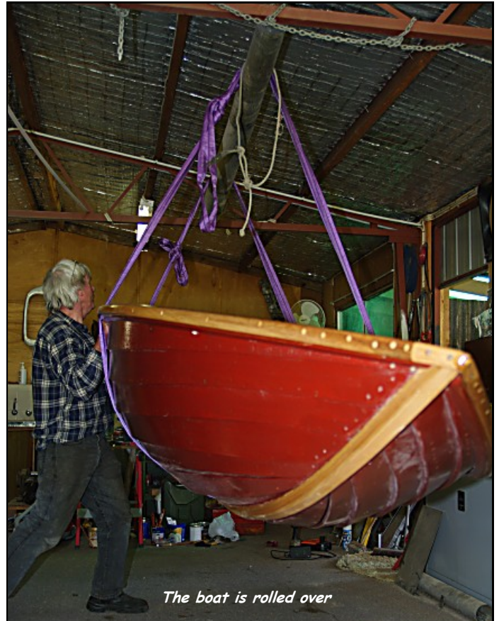
The boat is rolled over