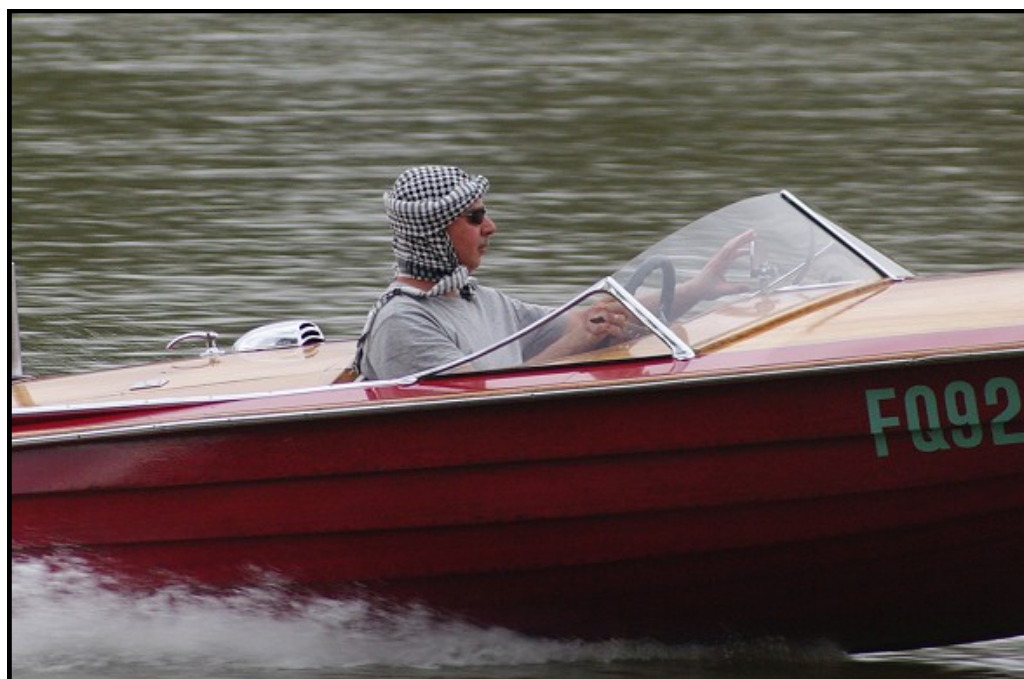
Does anyone know this man? (Narrandera 2012)