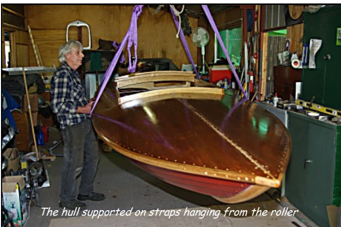
The hull supported on straps hanging from the roller

Ross has set up a method of turning the boat such that he has a round timber pole spanning two cross braces in the roof of his shed. The pole, or roller, is about 5 or 6 inches in diameter with a steel axle that rides directly on the shed's steel cross bracing.