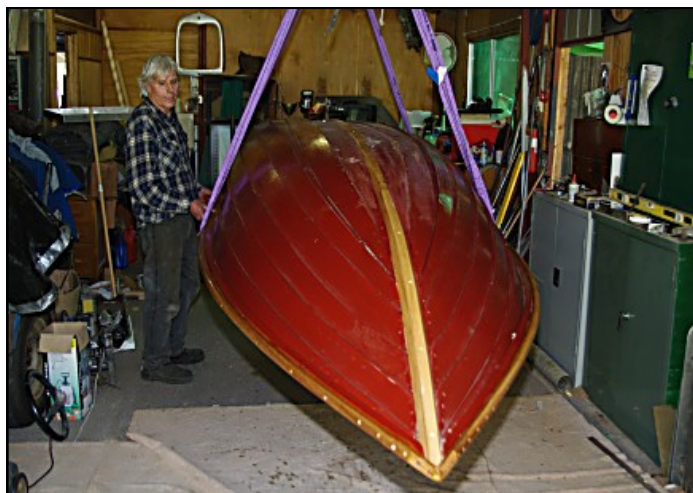
Straps now ready to come off after settling the hull on trestles

You can keep track of where Ross is at with the boat via regular updates on the website's Bulletin Board.