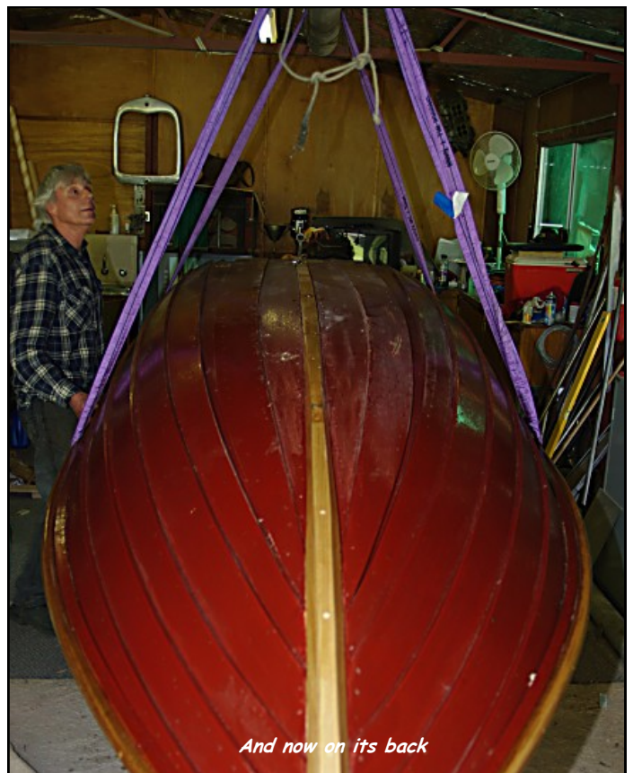
And now on its back