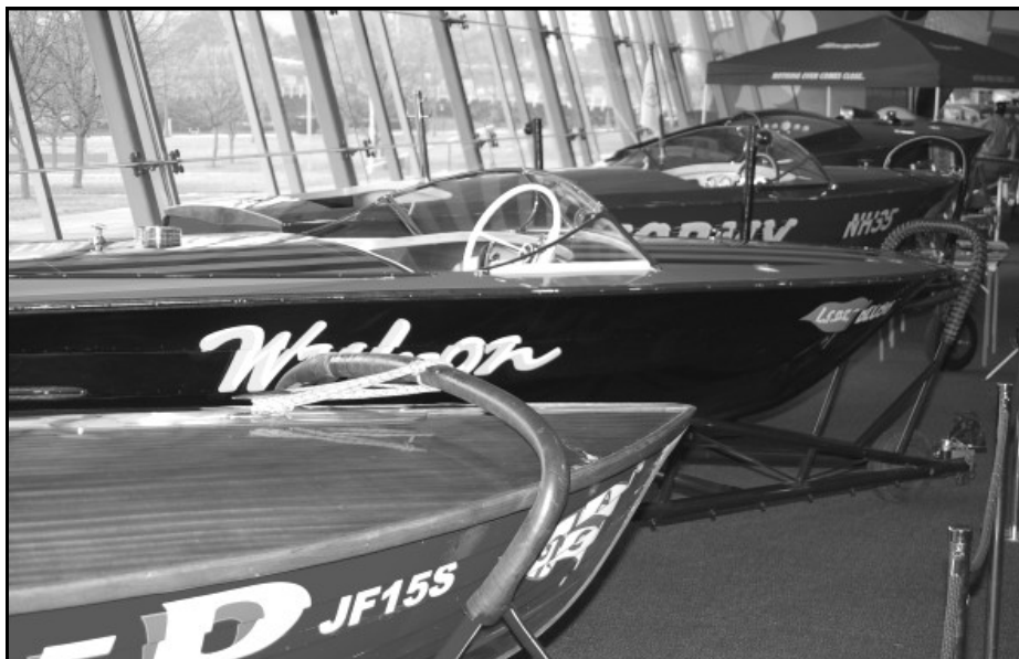
The CAWPBA line up

The show was the first public appearance for Wyh-on , Chris Findlay's 1962 Lewis runabout. The boat certainly made an impact with its striking deck of contrasting striped pattern of natural timber and burgundy stain with a green painted band running around the gunwales. This scheme was copied from the original deck. Apparently Wyh-on was built alongside an identical runabout, with both boats coming to Victoria. The other boat became the Alan Fordham's very successful raceboat, Venus . Wyh-On remained a ski-