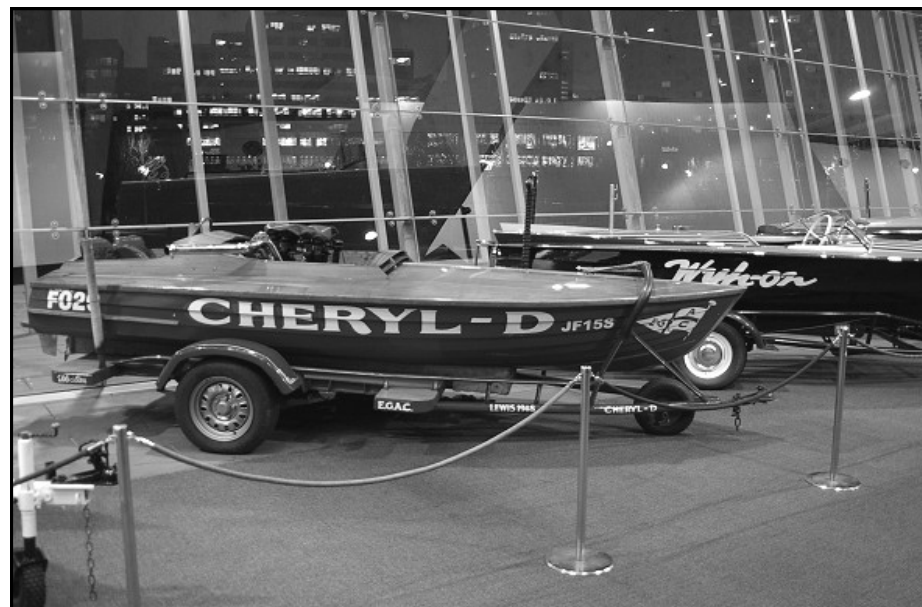
Cheryl-D and Wyh-On