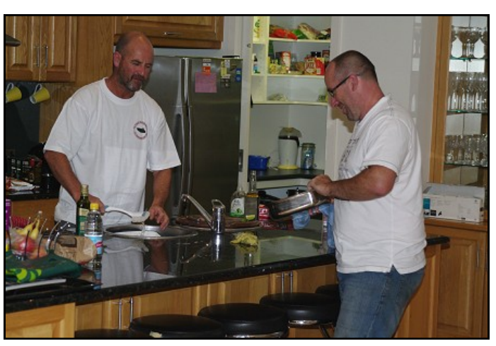
Kitchen staff in our rental house

Impact was performing really well on its first serious outing until it overheated in the second event, causing a valve to stick open, effectively finishing it for the day. All the same, the boat showed some real potential with performance and handling.