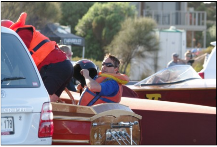
Back after a run

Wallis Jolly's 15' runabout Casandra ran faultlessly again. The performance of this boat belies its Dodge side valve. Another ply boat, Strewth , also performed well on the day.