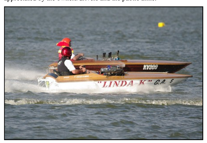
The smaller skiffs put on a great show

not normally have to bash through other boat wakes, particularly of the size thrown up by the larger boats. They were each given the opportunity to run individual demonstrations, showing the crowd what they were capable of when running in their ideal conditions. Both were applauded warmly by the crowd after the completion of their individual runs. What sets this event apart from race meets was the fact that these two boats were slotted into the program to do these runs when the opportunity arose during a couple of quiet periods, something well appreciated by the owners/drivers and the public alike.