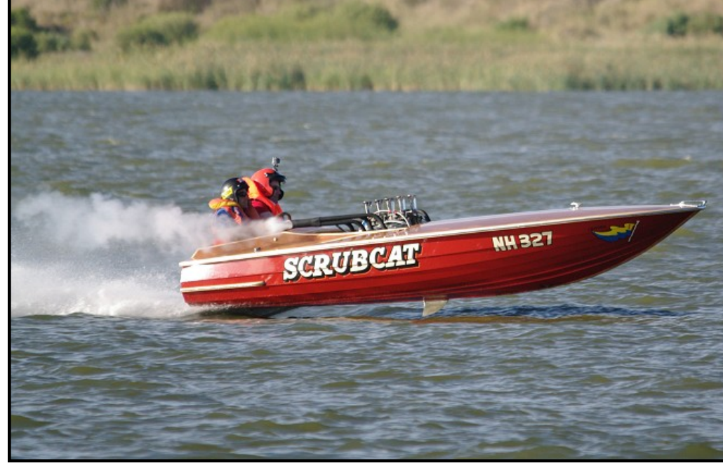
Driver and cameraman (or is that a growth?)