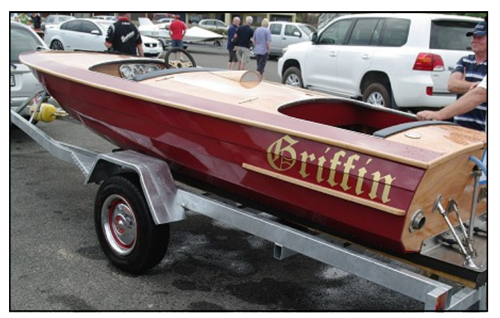
Griffin fresh out of its resto

Dig Traeger had his big 454 powered hydro back again. The Sting , all 25 feet of her, was as spectacular as ever with that big block Chev sounding as good as ever and rooster tail as tall as ever.