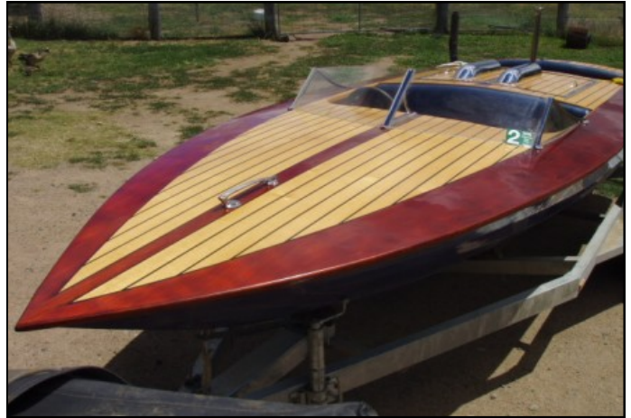
Minx pictured earlier this year