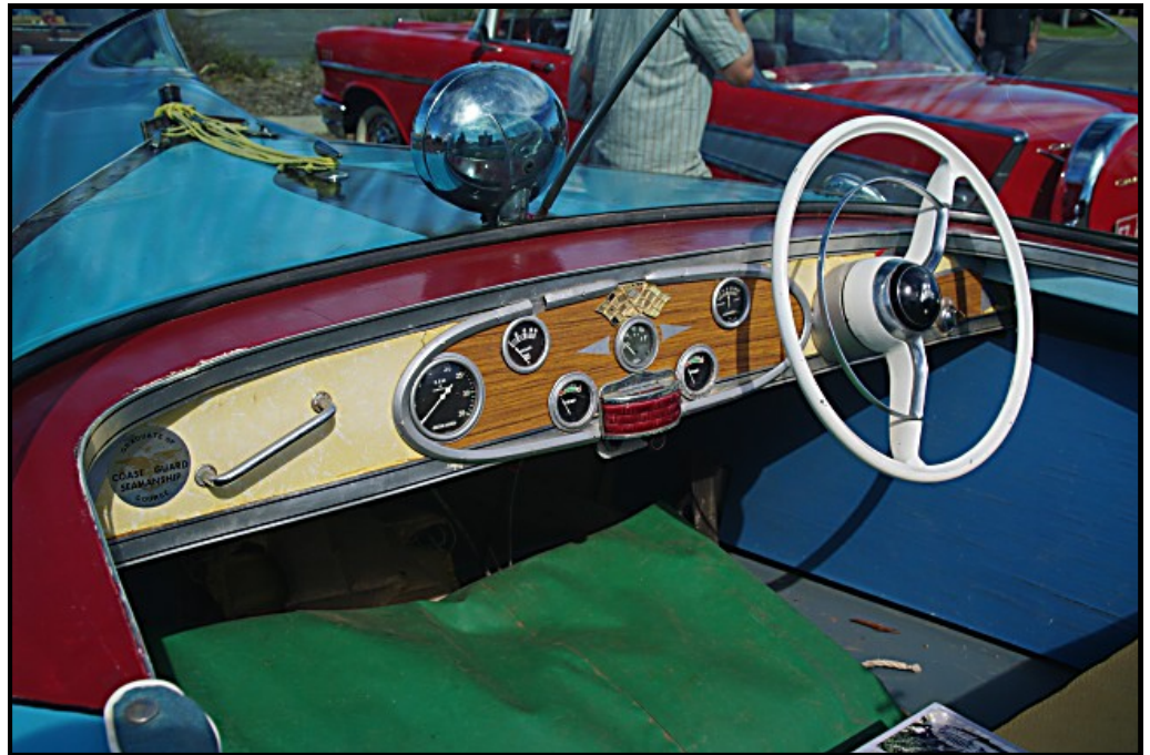
Classic interiors - early 1950's Hartley