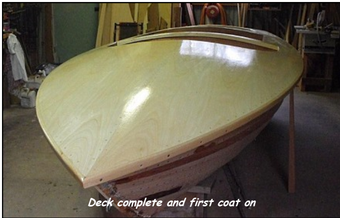
Deck complete and first coat on