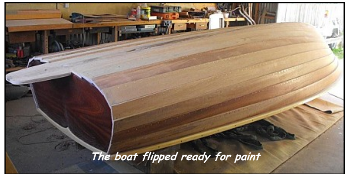
The boat flipped ready for paint