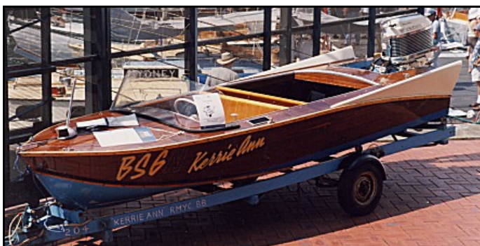
At the 2002 Sydney Classic & Wooden Boat Festival