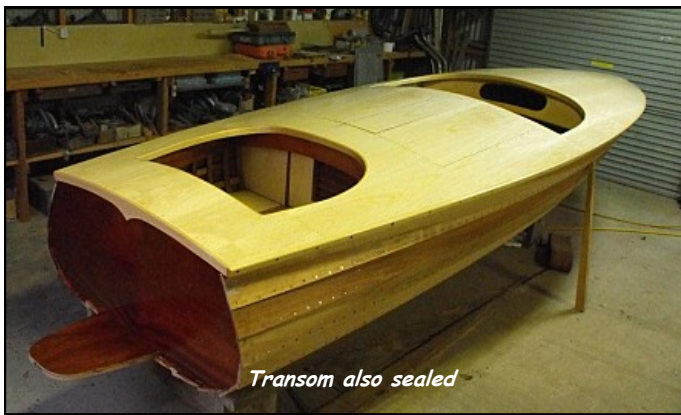
Transom also sealed