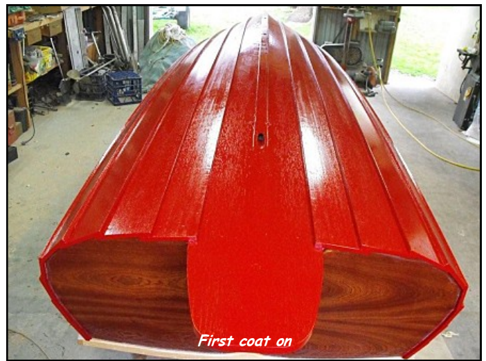
First coat on