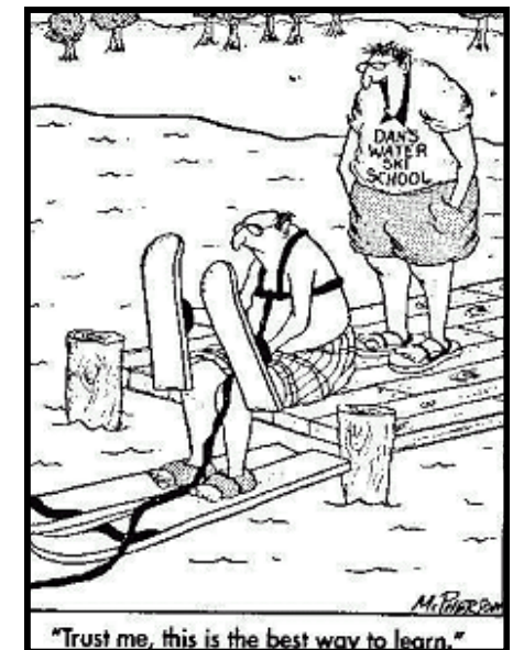
"Trust me, this is the best way to learn."

If anyone has some suggestions, let me know