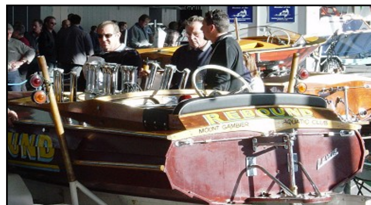
Assuming "The Position"

least two people there at most times and up to six at others. The stand was never left unattended (thanks Leigh), meaning somebody was always available for the public to talk to.