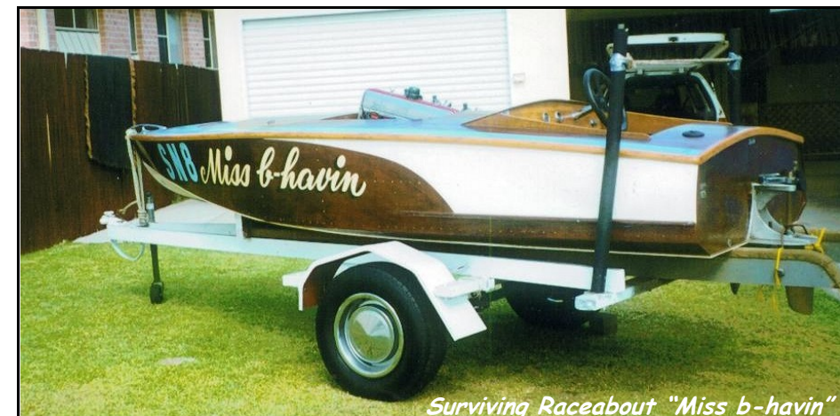
Surviving Raceabout "Miss b-havin"

To suit this type of two-seater a name was necessary, and it has been suggested that the title "Raceabout" is quite a good one, from the "Racing Runabouts" of the U.S.A.