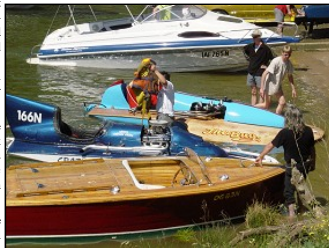
Cee Cee, Crazy Baby and The Bug