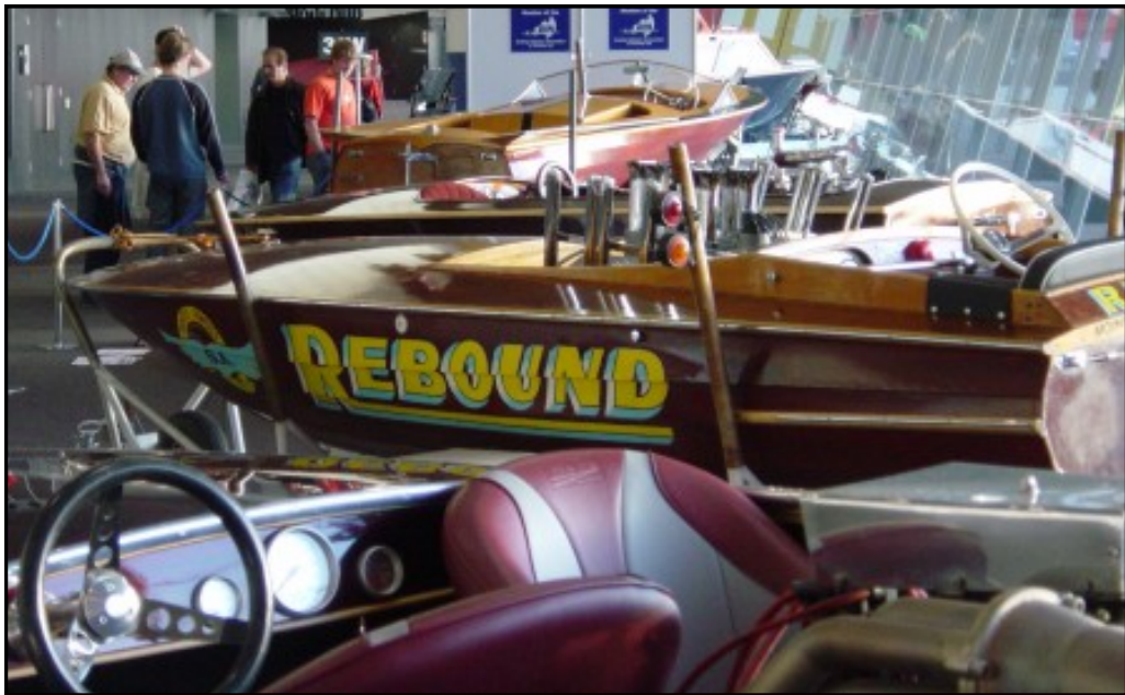
The 2003 Melbourne Boat Show

How's this to brighten your day - full colour! Hang the expense.