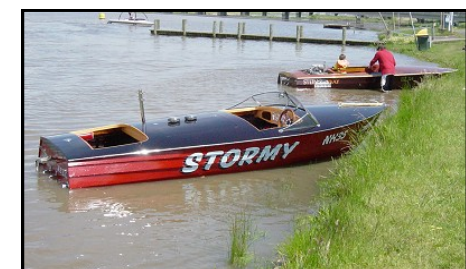
Stormy and Steinway

Having the two kilometer stretch of water virtually to ourselves, the boats got a good work out.