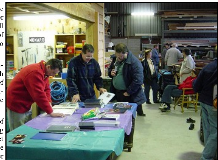
There was always something to look at or talk about

There was a bit of dialogue going about the next Wet Together for the Victorian Chapter now that some serious rain is happen-