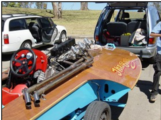
Readying "The Bug"