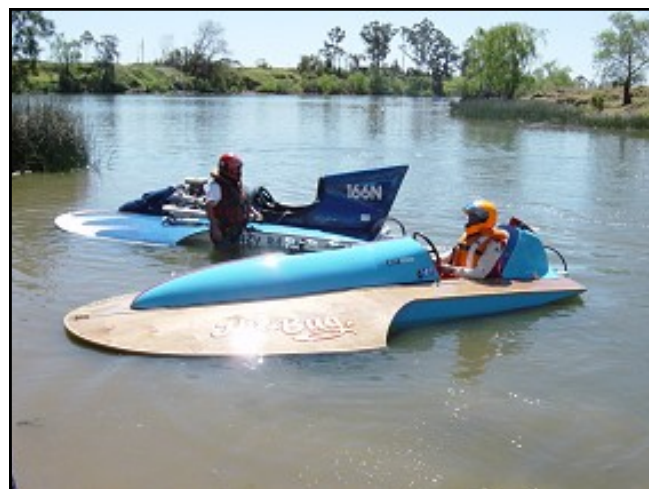
The Bug and Crazy Baby ready to run

FF Sure was launched on the return of the two hydros. After some initial starting problems brought about by the engine's dislike of having its exhausts in the water, the 350 Chev eventually burst into life. This skiff is still a very