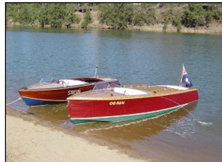
Cee Cee and Mystress

In the early afternoon the boats headed up the river to a beach area just past the bridge. Rob set up the BBQ and lunch was cooked.