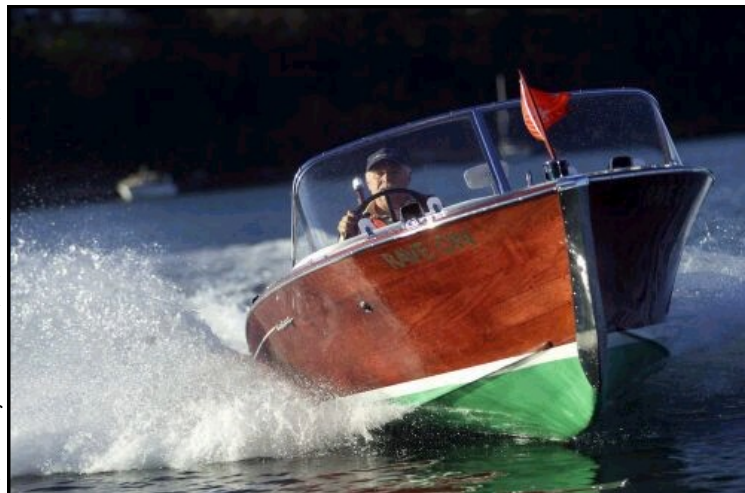
Back in the water on Sydney Harbour

More pictures and information on these boats can be seen on the Pheonix Marine website. There is a link to the site on the 'Links' page of the Classic Australian Wooden Power Boat Website.