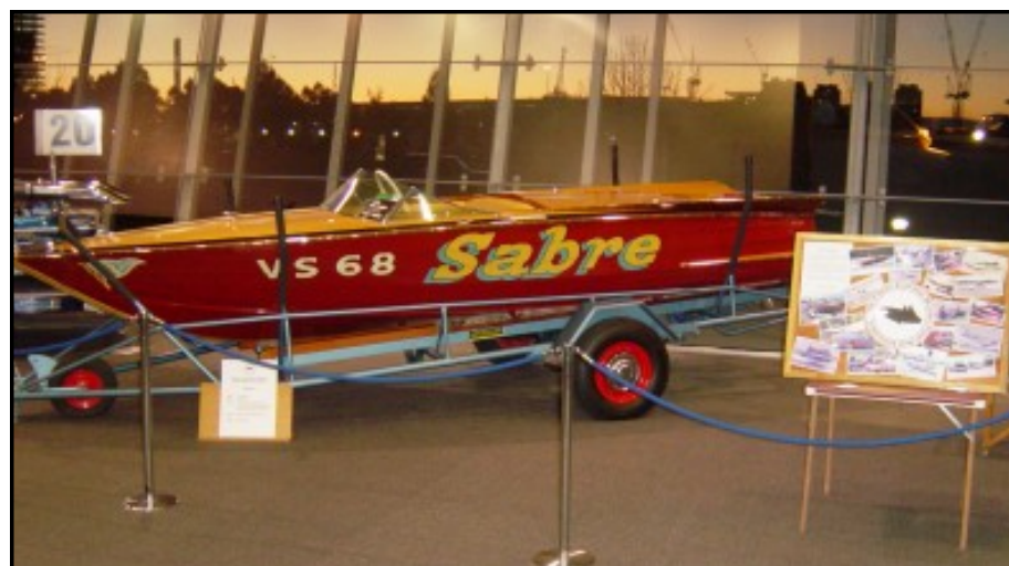
Winton runabout Sabre

Boats are also wanted for display in the event. It is intended that there will be demonstrations of the boats on the water as well as a land based static display (under cover), so please let me know if you are interested in attending. Of course, interstate boats are most welcome.