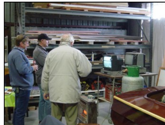
Dirty movies? Nah, probably just boats.

ing in Victoria. Most lakes are still a long way from being really usable for power boating, but the water levels are certainly improving. All the same, there are lakes with good water and the time is fast approaching that we will grace such lakes with our presence.