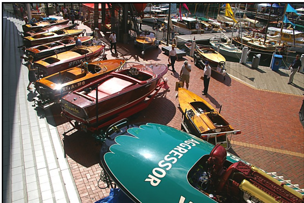
Just some of the line up

The Sydney Classic and Wooden Boats Festival was held in early March and was again a very successful show for powerboats, with 17 woodies on display.