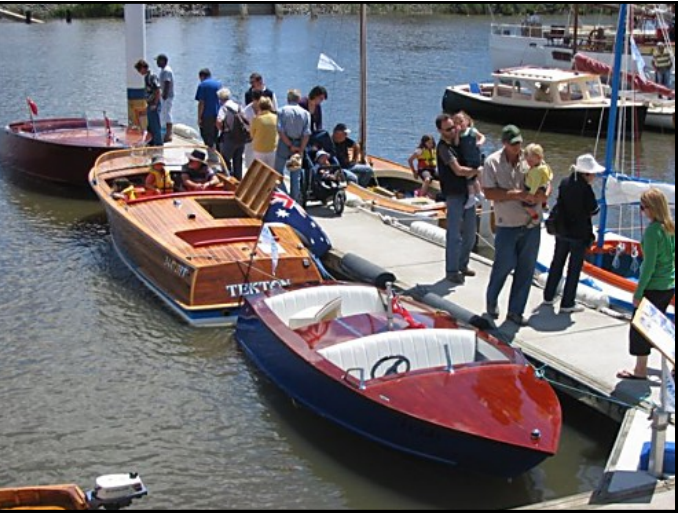
Mistral, Tekton and Miss Kitty

ply below the chine and a new Australian Red Cedar deck. The gunwale, trim and dashboard are fashioned from 180 year old Australian Red Cedar salvaged from the owner's home renovation in