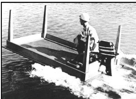
Is this the latest craze in wooden power boating?

Greg Carr AH: (03) 9370 2987 Mob: 0408 937 029 Email: gca42796@bigpond.net.au