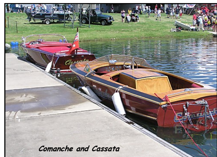
Comanche and Cassata

Hopefully next time we will be able to fill the docks with vintage boats at this truly perfect international show venue. Bring on 2009.