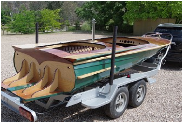
Nova back on its trailer and back from Huskisson

With Nova safely back in the shed at the other property, it will have to wait now until the new shed is built before any fitting out is started. One exception is the engine, which has gone to Alan Price for a complete rebuild.