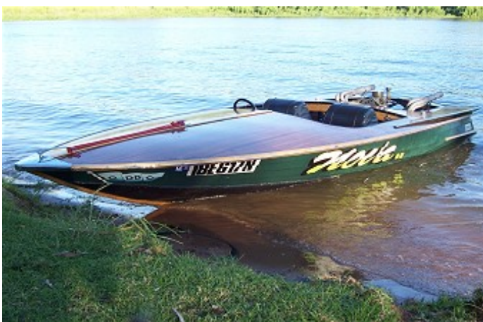
Nova in 2004

Nova's hull was basically sound except for some rot in four planks where they met the transom as well as the transom being soft in those contact areas. The rotted planks were at the top, two on each side. The transom was also cracked.