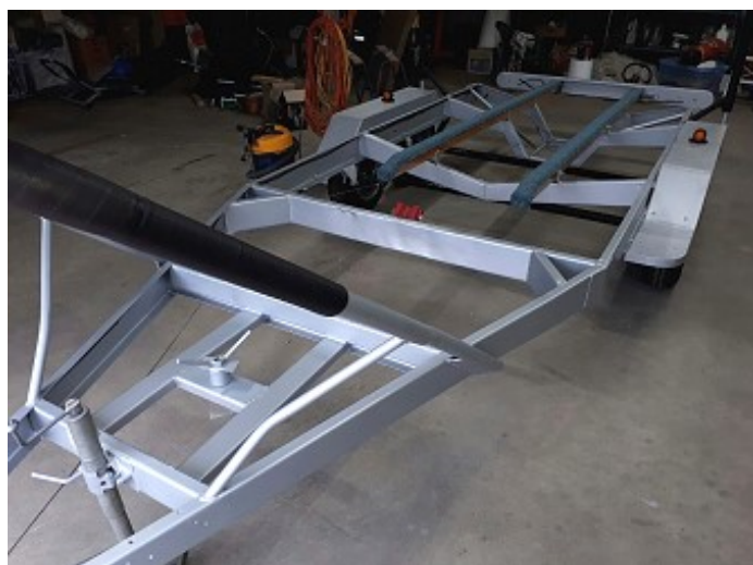
The trailer finally finished

It turned out the boat sat on the trailer fine and nothing needed to be done, so we set off back home. With the boat on the trailer, the trailer travelled really well, even on the concrete Hume.