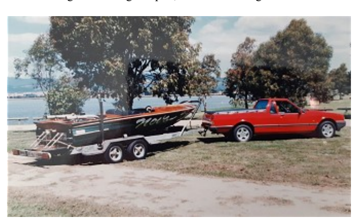
1993 at Hazelwood

Still another small craft but really a top line performer in all respects. Manufactured by Seacraft of Wells Rd, Mordialloc, the small runabout turned in an excellent showing and left us wondering why many people pay so much money for a larger craft. The twin cockpits were both foam rubber upholstered; rear compartment had bags of space; a good range of instruments were fitted including a hand throttle; a Ford 10 engine gave a top run of 29 mph and we did not fill the tank during almost a full day of testing. Handling was good although there was a tendency towards power fall-off under hard cornering. We found it perfect for skiing and the hand throttle was a definite advantage for maintaining standard ski speeds. At a price of £549 complete with all fittings and ready for the water, we consider this craft to offer excellent value.