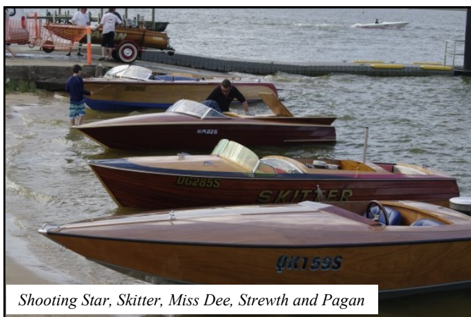
Shooting Star, Skitter, Miss Dee, Strewth and Pagan