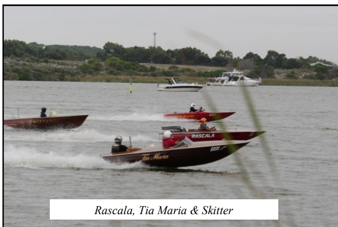
Rascala, Tia Maria & Skitter