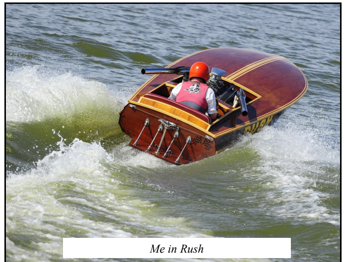
Me in Rush