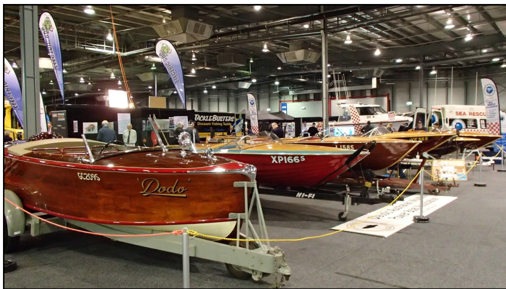
Dodo heads the 7 boat line up at the Adelaide Boat Show